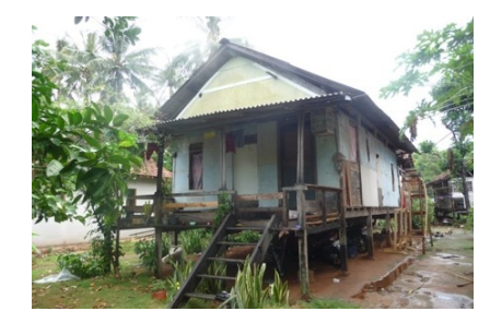
House of Bugenese