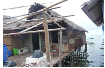
House of Bajo People

in this archipelago. There are about ten ethnics live in,